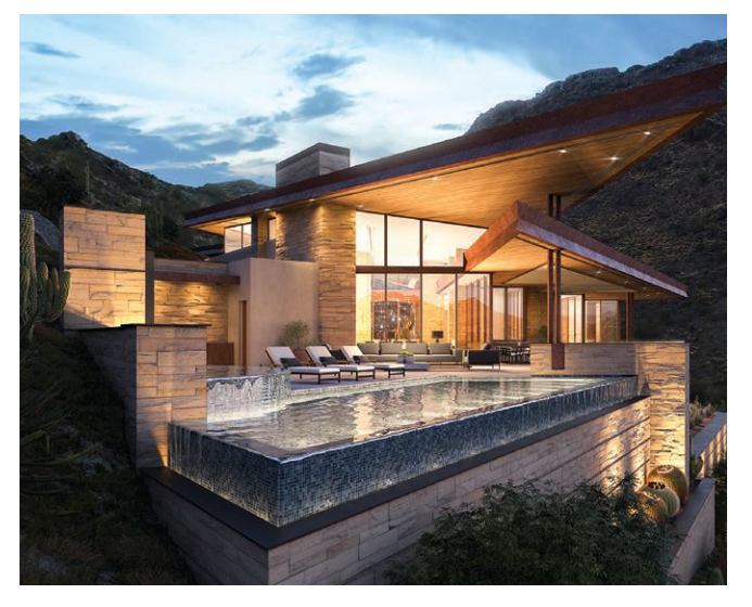
From top: Mountain views serve as the backdrop of the Jade residence's living room; an evening look at the Jade residence's sparkling pool area.